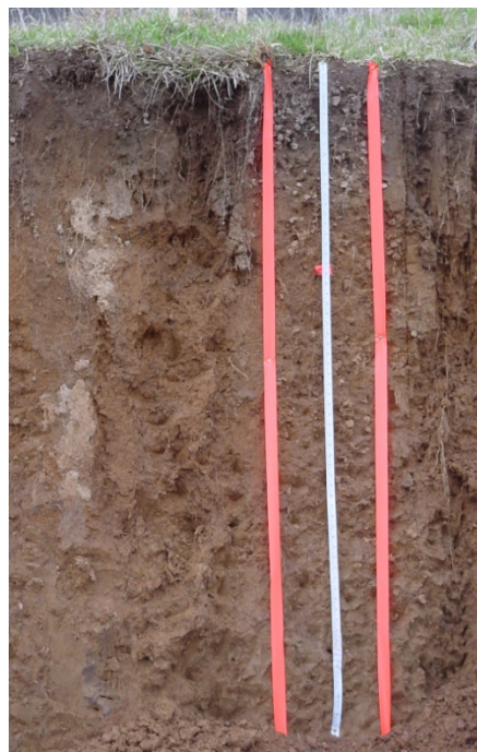
Figure 2. Example of restricted area of pit wall.

A restricted area on the pit wall will be outlined with flagging and a tape measure mounted for every practice and contest pit that is NOT to be disturbed, and a nail will be inserted somewhere in the third horizon of each pedon, similar to that pictured in Figure 2. Contestants should provide the following for their personal use: tape measure, clinometers (or Abney level), water bottle or sprayer, acid bottle, knife, pencils, Munsell color charts (10R to 5Y), hand towel, hand lens, and containers for soil samples. Calculators, 2-mm diameter sieves, and clipboards may also be used. No other materials other than those supplied by the host will be permitted during the contest. Cell phones, pagers, or other communication devices are prohibited during the contest. Talking is NOT permitted between contestants during the 50 minutes of pit judging. Pit monitors will be instructed to collect scorecards from contestants and they will receive a zero for that pit if any of the above rules are broken, especially talking to other contestants. Contestants should show respect for each other and avoid creating distractions during the competition.