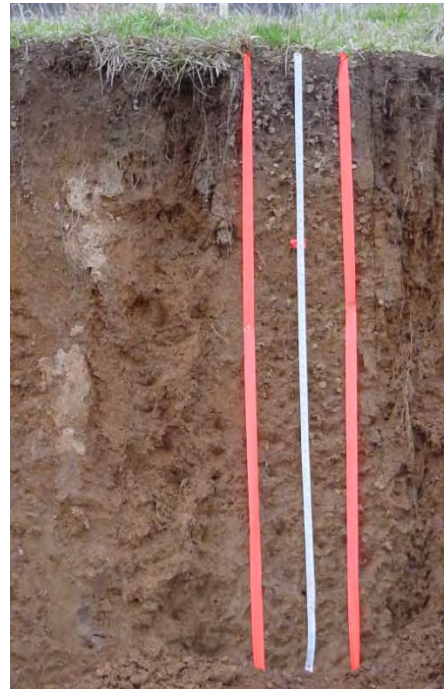
Figure 2. Example of restricted area of pit wall.

A restricted area on the pit wall will be outlined with flagging and a tape measure mounted for every practice and contest pit that is NOT to be disturbed, and a nail will be inserted somewhere in the third horizon of each pedon, similar to that pictured in Figure 2. Contestants should provide the following for their personal use: tape measure, clinometers (or Abney level), water bottle or sprayer, acid bottle, knife, pencils, Munsell color charts (10R to 5Y), hand towel, hand lens, and containers for soil samples. Calculators, 2-mm diameter sieves, and clipboards may also be used. No other materials other than those supplied by the host will be permitted during the contest. Cell phones, pagers, or other communication devices are prohibited during the contest. Talking is NOT permitted between contestants during the 50 minutes of pit judging. Pit monitors will be instructed to collect scorecards from contestants and they will receive a zero for that pit if any of the above rules are broken, especially talking to other contestants. Contestants should show respect for each other and avoid creating distractions during the competition.