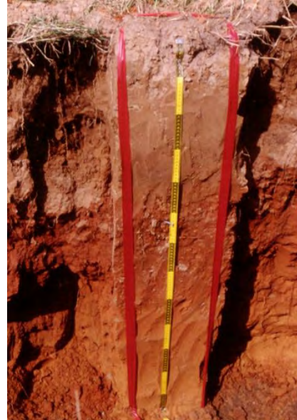
Figure 2. Example of restricted area of pit wall.

The restricted area on the pit wall will be outlined with flagging and a tape measure mounted that is NOT to be disturbed, and a nail will be inserted somewhere in the third horizon of each pedon (Fig. 2). Contestants should provide the following for their personal use: tape measure, clinometers (or Abney level), water bottle or sprayer, acid bottle, knife, pencils, Munsell color charts (10R to 5Y), hand towel, hand lens, and containers for soil samples. Calculators, 2 mm diameter sieves, and clipboards may also be used. No other materials other than those supplied by the host will be permitted during the contest. Cell phones, pagers, or other communication devices are prohibited during the contest. Talking is NOT permitted between contestants during the 50 minutes of pit judging. Pit monitors will be instructed to collect scorecard from contestants and they will receive a zero for that pit if any of the above rules are broken, especially talking to other contestants. Contestants should show respect for each other and avoid creating distractions during the competition.